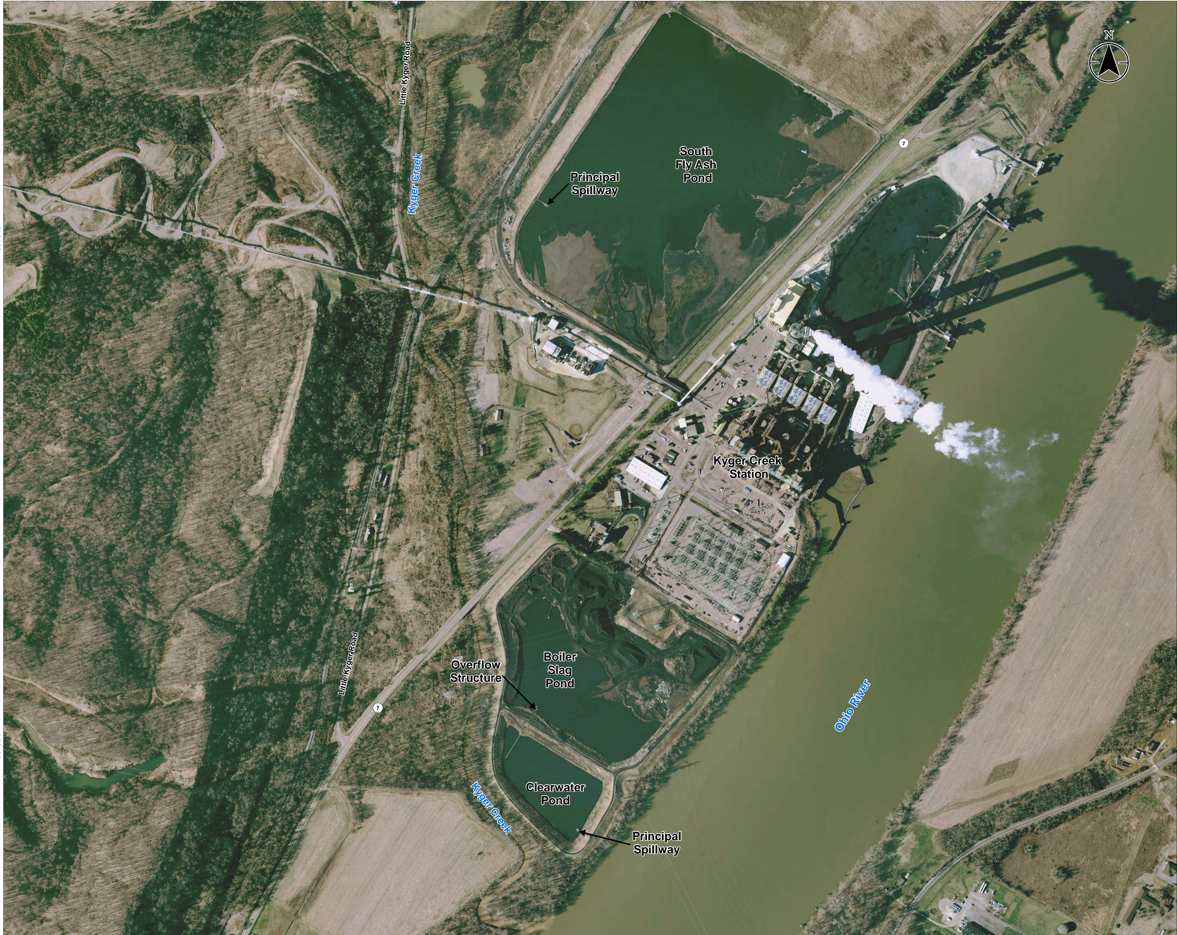
Figure No. A-1 Title Plan View of Kyger Creek Station

Client/Project Kyger Creek Station - Structural Stability South Fly Ash Pond and Boiler Slag Pond